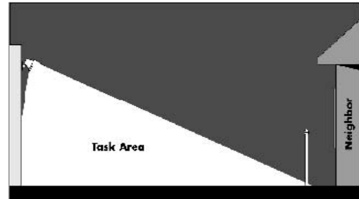
Figure 50-39.1-B: Complies -- No light trespass