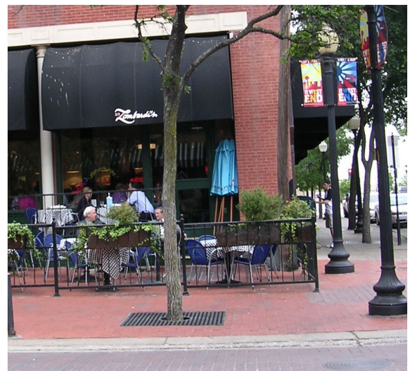
Figure 50-26.4-A: Form district front setback wall height

The maximum height of a fence or wall within required side and rear yard area is eight feet, but the land use supervisor may approve a fence or wall up to 12 feet in height where additional height is to provide adequate security because of topography or the nature of the material or equipment stored in the area. Fences and walls are not permitted in required front yard areas, except for wrought iron fences used to enclose outdoor patio or dining areas, in which case the maximum height of the fence shall be three feet;