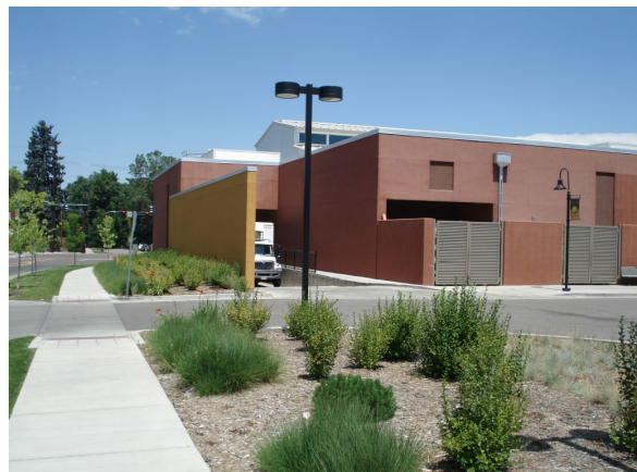
Figure 50-26.2-A: Loading area screening