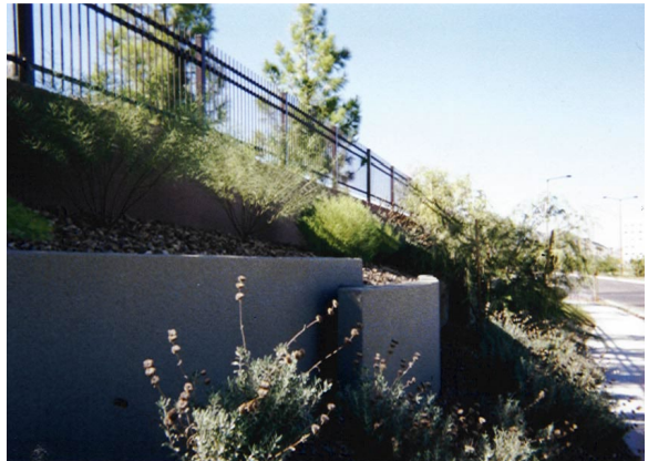
Figure 50-26.4-B: Retaining wall terracing and articulation