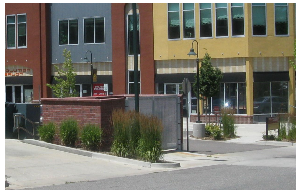
Figure 50-26.3-A: Dumpster screening